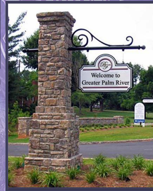
Community Gateway Sign