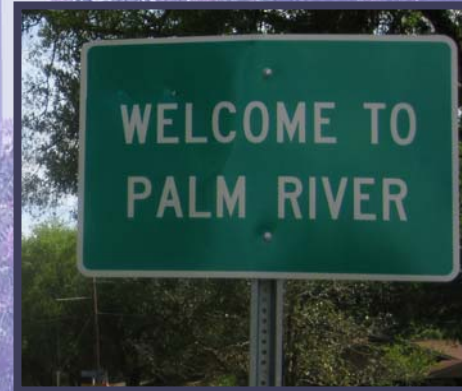
Community Entry Sign