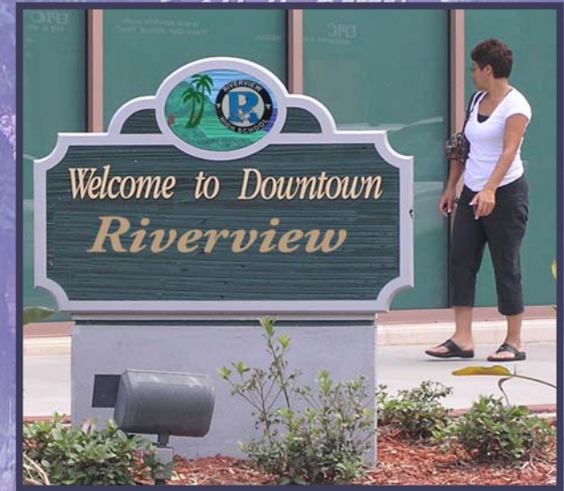
Business District Sign