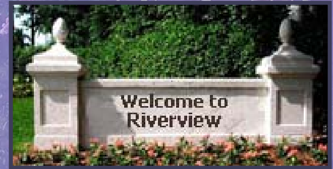
Community Gateway Sign