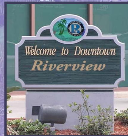
Business District Sign