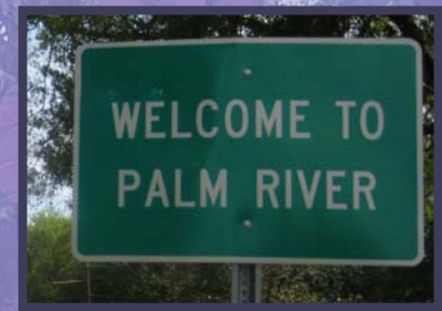
Community Entry Sign